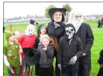
The Witches' Walk

Scoil na Maomh Uilig is an inclusive school – one of only two in Ireland – where disabled pupils are catered for. Despite the difficulties, the staff are very enthusiastic.