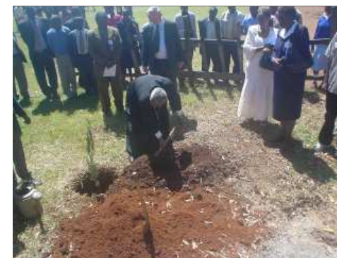
Planting of Commemorative Tree