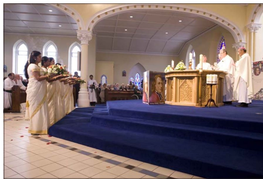
At The Consecration