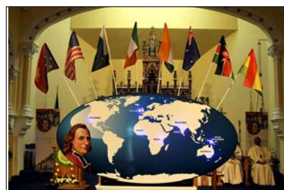
World Map & Flags of the Nations

Before the commencement of Mass, representative Brothers placed the flag of each country on a large map of the world at the front of the altar. The map was a 'work of art' by Bro James Murphy. Placement of each flag on the map triggered the glowing of a light in the corresponding country.