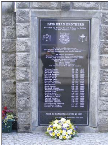
Wall Panel at Church commemorating earlier burials

This simple ceremony of remembrance and thanksgiving was an appropriate testimony to the men whose remains lie at the birthplace of our Congregation, ‘where it all started’.